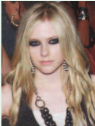
AVIRL LAVIGNE: Doing it with "Girlfriend"