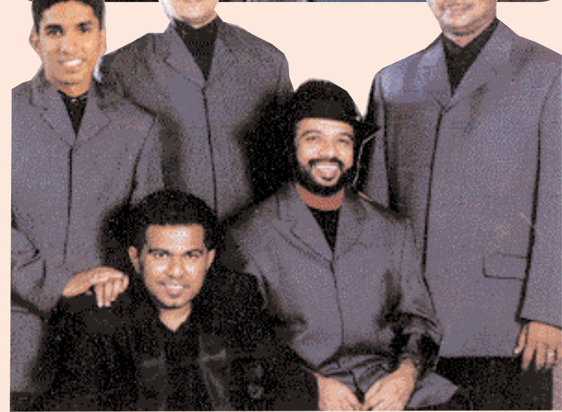
GYPSIES: One hour of bailla at Smithsonian