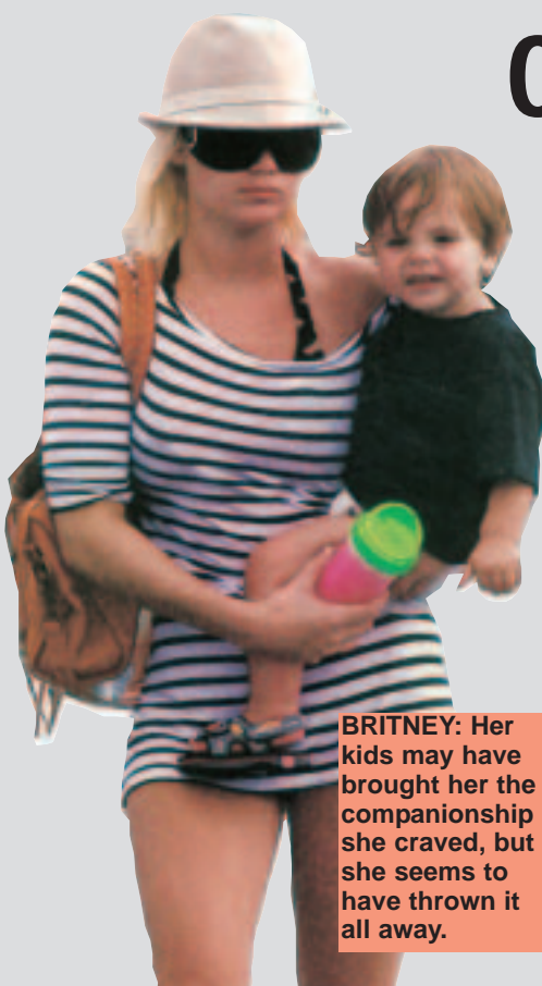
BRITNEY: Her kids may have brought her the companionship she craved, but she seems to have thrown it all away.