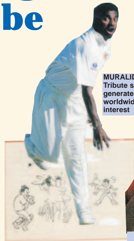
MURALIDARAN: Tribute song generates worldwide interest