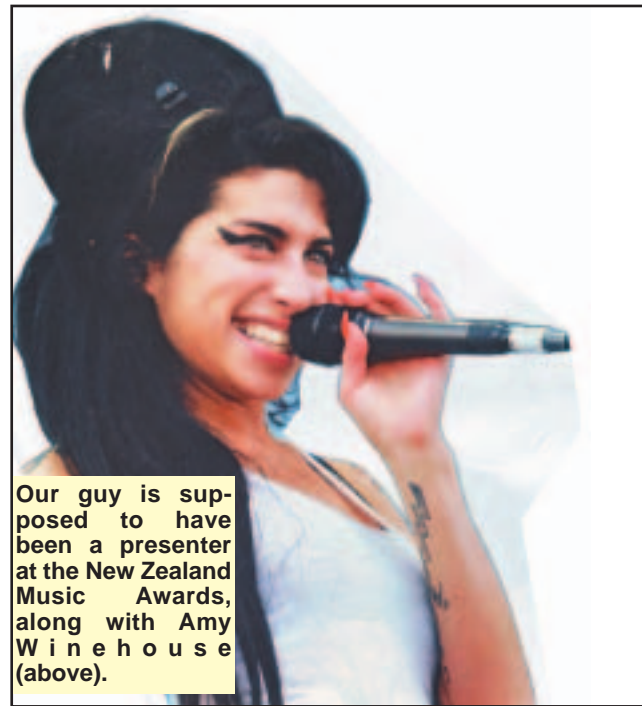
Our guy is supposed to have been a presenter at the New Zealand Music Awards, along with Amy Winehouse (above).

We usually check and double check whatever that comes our way, and where this self-proclaimed 'superstar' is concerned, we couldn't find on iota of truth in what was told to us. And neither was he in a position to provide us with any tangible evidence to support his claims. When we wanted him to substantiate his claim of having done VIP concerts for VIPs in a neighbouring country, he came up with a very sweet excuse. Yes, his camera had got jammed and the photographs of his performances cannot be retrieved, he said How convincing! He then touched on a series of concerts that he propose doing in the Far East and he was very keen