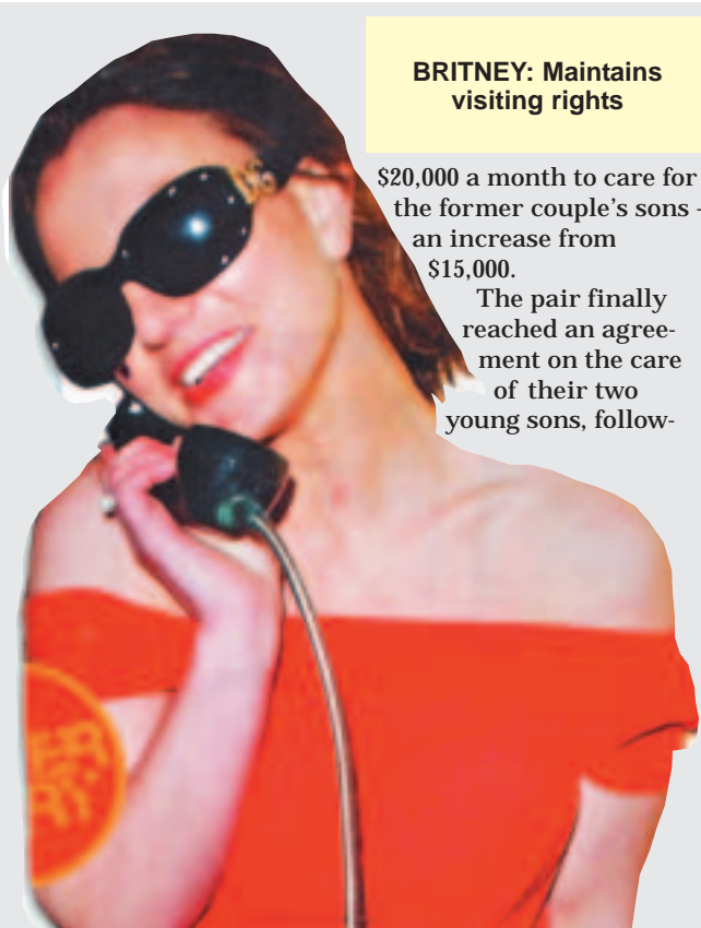
BRITNEY: Maintains visiting rights