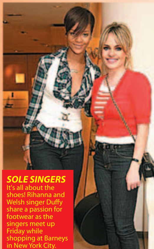
SOLE SINGERS It's all about the shoes! Rihanna and Welsh singer Duffy share a passion for footwear as the singers meet up Friday while shopping at Barneys in New York City.