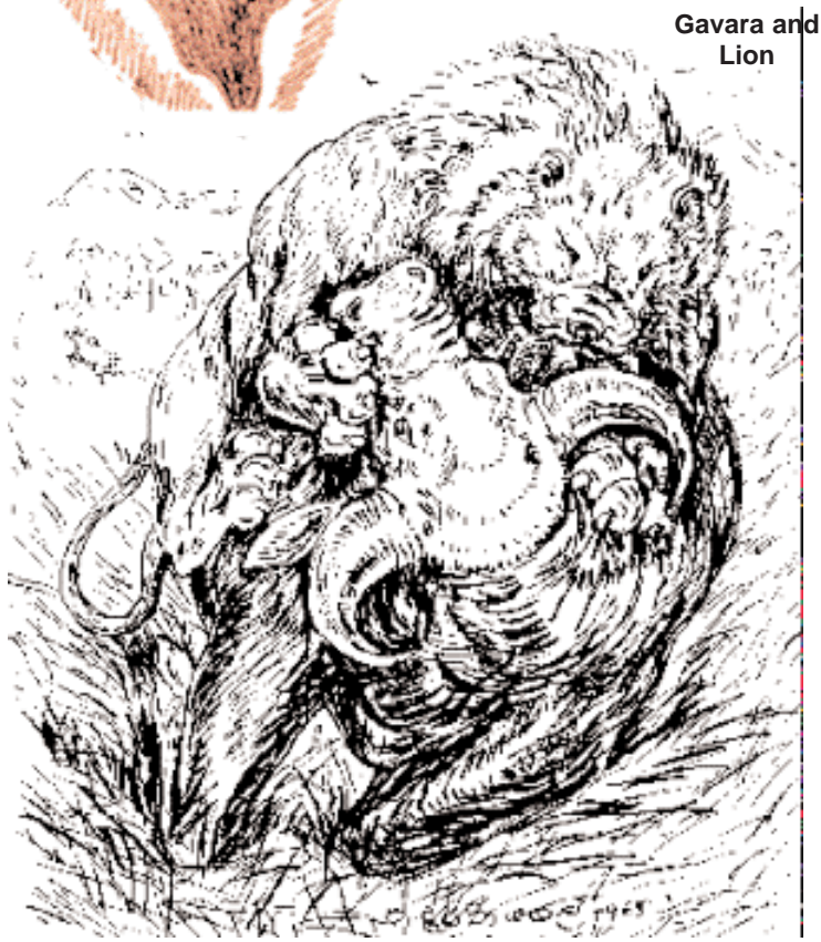
Gavara and Lion