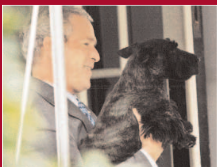
President Bush picks-up his dog Barney before walking into the main residence of the White House following his arrival, Wednesday, Oct. 15, 2008 in Washington.