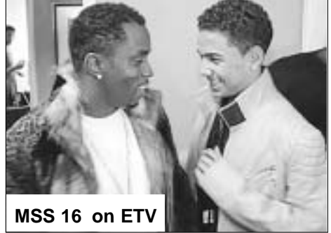
MSS 16 on ETV