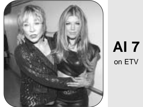
AI 7 on ETV