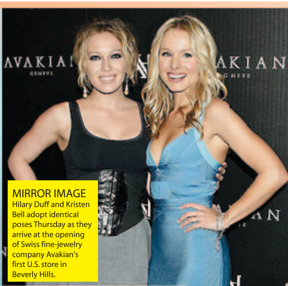
MIRROR IMAGE Hilary Duff and Kristen Bell adopt identical poses Thursday as they arrive at the opening of Swiss fine-jewelry company Avakian's first U.S. store in Beverly Hills.