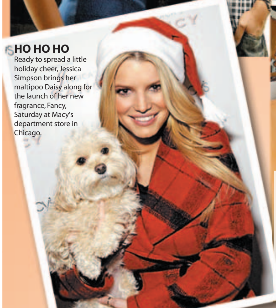
HO HO HO Ready to spread a little holiday cheer, Jessica Simpson brings her maltipoo Daisy along for the launch of her new fragrance, Fancy, Saturday at Macy's department store in Chicago.