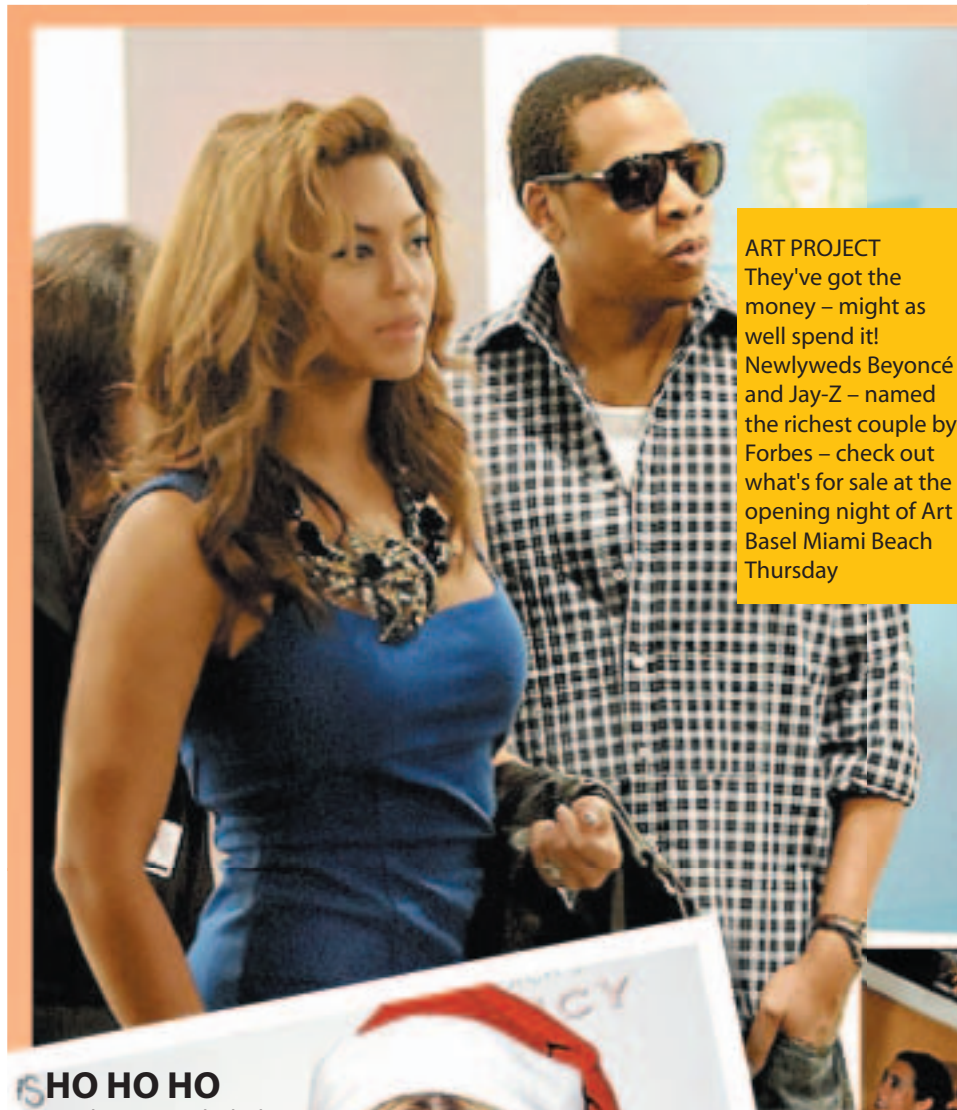
ART PROJECT They've got the money - might as well spend it! Newlyweds Beyoncé and Jay-Z - named the richest couple by Forbes - check out what's for sale at the opening night of Art Basel Miami Beach Thursday