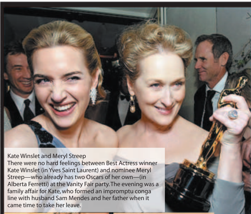
Kate Winslet and Meryl Streep There were no hard feelings between Best Actress winner Kate Winslet (in Yves Saint Laurent) and nominee Meryl Streep—who already has two Oscars of her own—in (Alberta Ferretti) at the Vanity Fair party. The evening was a family affair for Kate, who formed an impromptu conga line with husband Sam Mendes and her father when it came time to take her leave.