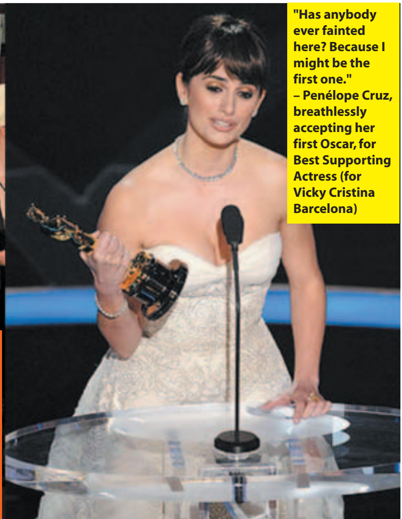
"Has anybody ever fainted here? Because I might be the first one." — Penélope Cruz, breathlessly accepting her first Oscar, for Best Supporting Actress (for Vicky Cristina Barcelona)