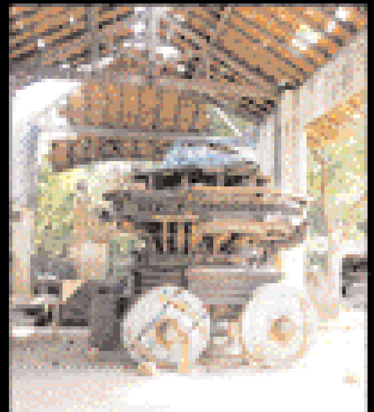
An ancient Chariot