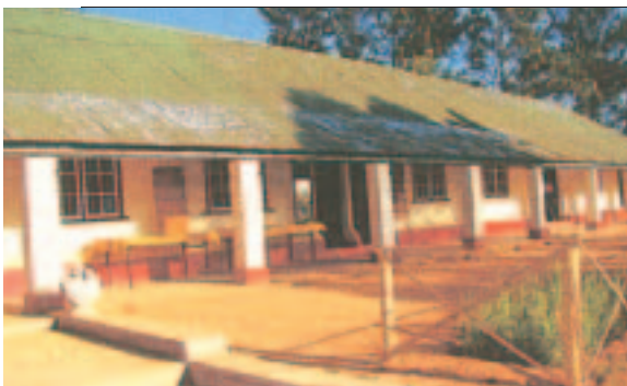
Renovation of junior Cadets' Mess

The Sri Lanka Military Academy - the prestigious military training institution located in the small garrison town called Diyatalawa amidst beautiful hills and valleys with an ever-blessed salubrious climate is totally committed to train young gallant Officer Cadets, the true patriots of the nation who have dedicated their youthfulness in the name of country's safety and territorial integrity and sovereignty. It is they who provide the junior leadership to the war-front.