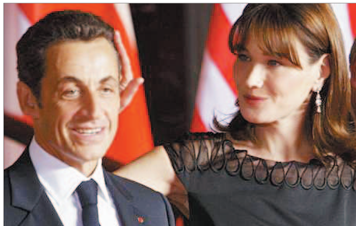
Carla Bruni-Sarkozy with her husband, the president of France Nicolas Sarkozy