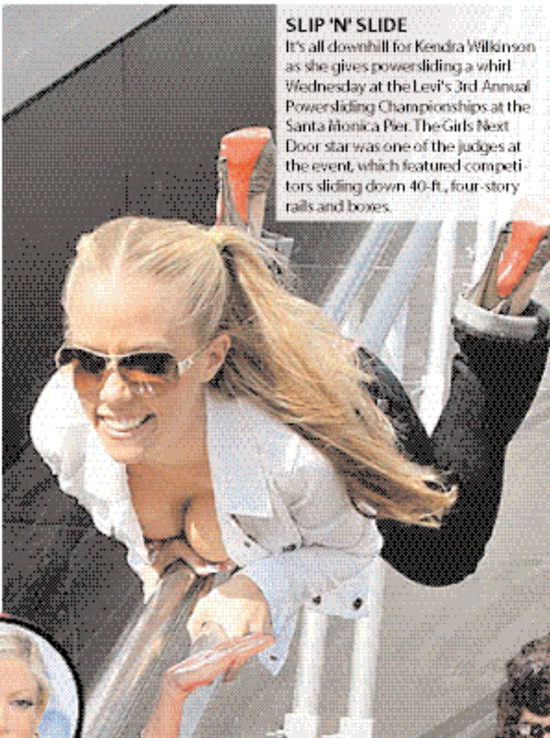
SLIP 'N' SLIDE It's all downhill for Kendra Wilkinson as she gives powersliding a whirl Wednesday at the Levi's 3rd Annual Powersliding Championships at the Santa Monica Pier. The Girls Next Door star was one of the judges at the event, which featured competitors sliding down 40-ft., four-story rails and boxes.