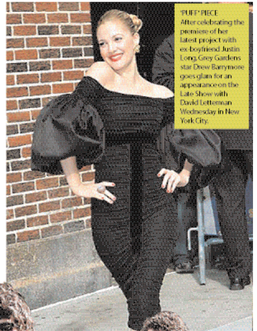
'PUFF' PIECE After celebrating the premiere of her latest project with ex-boyfriend Justin Long, Grey Gardens star Drew Barrymore goes glam for an appearance on the Late Show with David Letterman Wednesday in New York City.