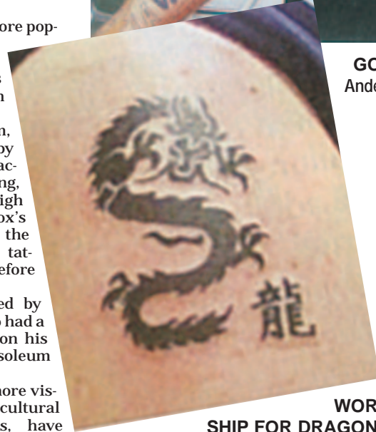
WORKSHIP FOR DRAGON: A dragon tattoo with a Chinese character "LongG" or dragon

earlier trip to Hong Kong had one side of his torso etched in traditional characters, written top to bottom, with the Chinese saying: "Death and life have determined appointments. Riches and honors depend upon heaven."