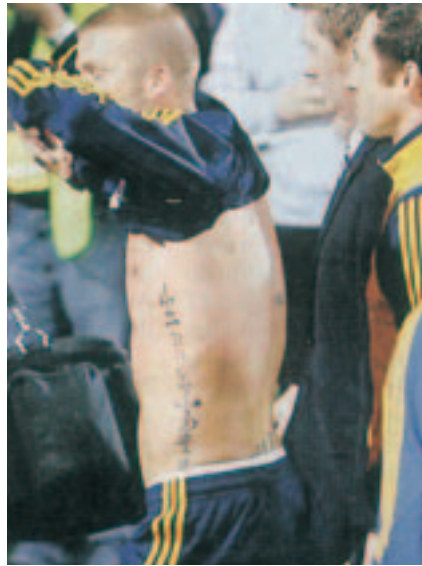
EXOTIC MARK: David Beckham has one side of his torso etched with a Chinese saying

One of the few NBA players to have lived in China, the Denver Nuggets' Chris Anderson briefly played for the