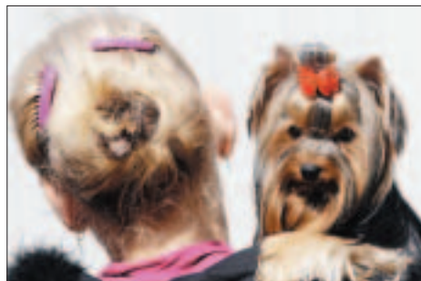
A woman holds her Yorkshire terrier during the 17th International dog exhibition in Prague, Czech Republic, Sunday, May 3, 2009.