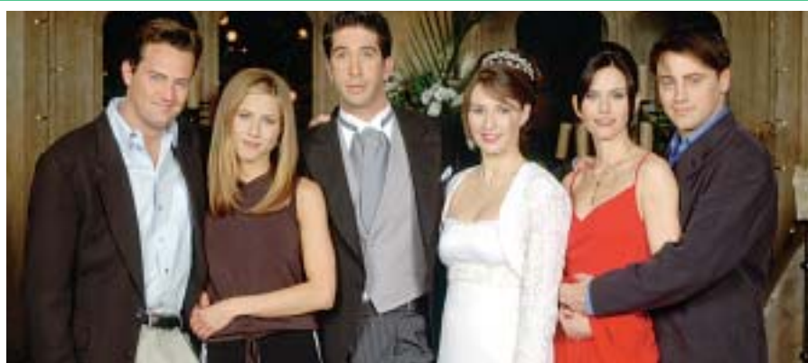
Every Saturday @ 8.30pm only on ETV