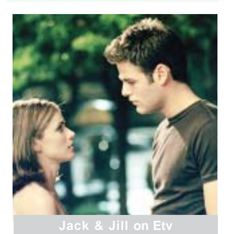
Jack & Jill on Etv