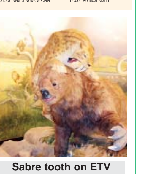
Sabre tooth on ETV