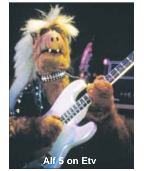
Alf 5 on Etv