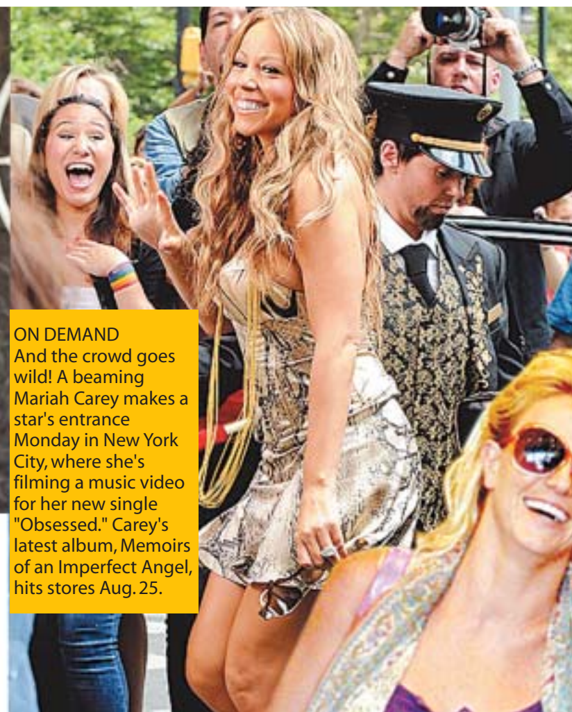
ON DEMAND And the crowd goes wild! A beaming Mariah Carey makes a star's entrance Monday in New York City, where she's filming a music video for her new single "Obsessed." Carey's latest album, Memoirs of an Imperfect Angel, hits stores Aug. 25.