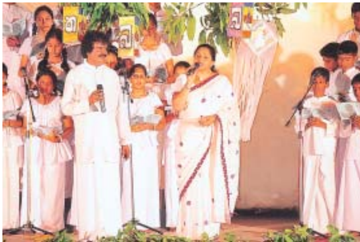
"Lyceum Poson Bakhti Gee" festival organised by the Lyceum International School, Nugegoda for Poson Poya 2009 was held at the Lyceum school premises recently.