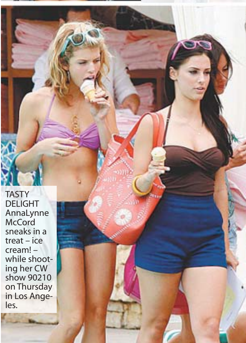
TASTY DELIGHT AnnaLynne McCord sneaks in a treat - ice cream! - while shooting her CW show 90210 on Thursday in Los Angeles.