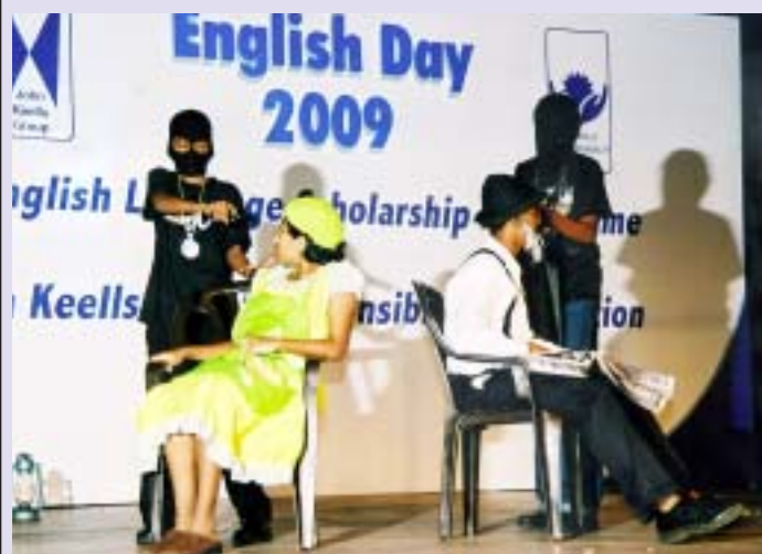
A scene from the play 'Get up and bar the door' by the Ratnapura branch.

In 2007/08, the Foundation sponsored two 6-month foundation courses granting scholarships to an aggregate of 533 school children. Implemented through Gateway Language Centres, the courses were conducted in 15 areas, namely, Anuradhapura, Bandarawela, Batticaloa, Colombo, Galle, Gampaha, Kalutara, Kandy, Kurunegala, Matara, Panadura, Ratnapura, Trincomalee, Vavuniya and Wattala. English Day 2009 celebrated the scholars of the second 6-month foundation course completed in November 2008.