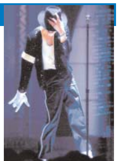
King of Pop was emaciated when paramedics arrived at his rented Los Angeles home following an emergency call.