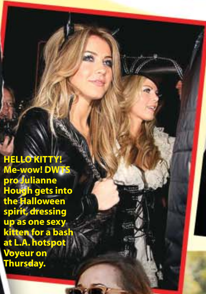
HELLO KITTY! Me-wow! DWTS pro Julianne Hough gets into the Halloween spirit, dressing up as one sexy kitten for a bash at L.A. hotspot Voyer on Thursday.