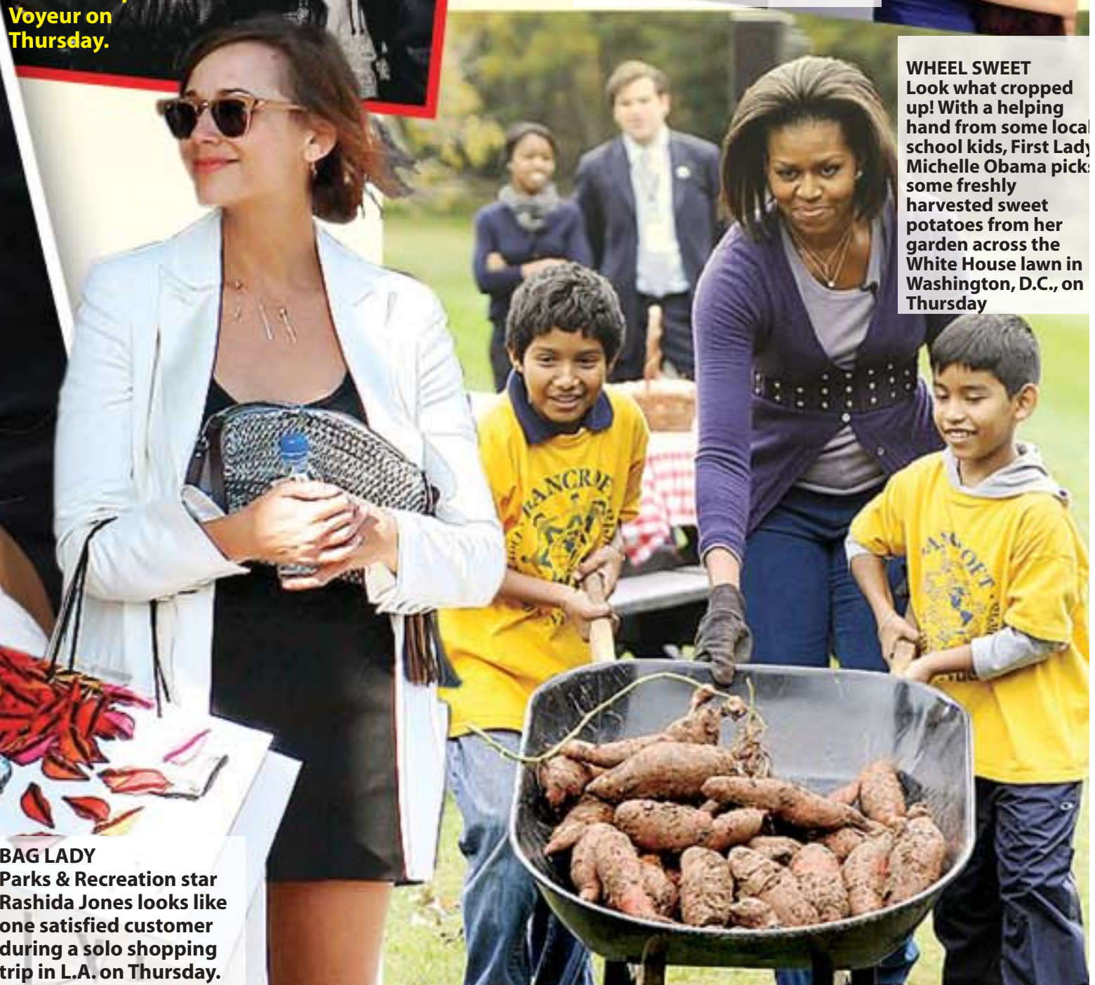
WHEEL SWEET Look what cropped up! With a helping hand from some local school kids, First Lady Michelle Obama picks some freshly harvested sweet potatoes from her garden across the White House lawn in Washington, D.C., on Thursday