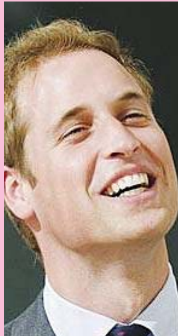
Prince William: Prince William, second in line to the throne, will be in Auckland and Wellington from January 17 to 19 before travelling to Australia for a three day unofficial visit

There were statements from both the New Zealand and Australian Prime Ministers about the Prince William's visit. By con-