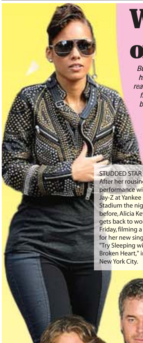
STUDD STAR After her rousing performance with Jay-Z at Yankee Stadium the night before, Alicia Keys gets back to work on Friday, filming a video for her new single, "Try Sleeping with a Broken Heart," in New York City.