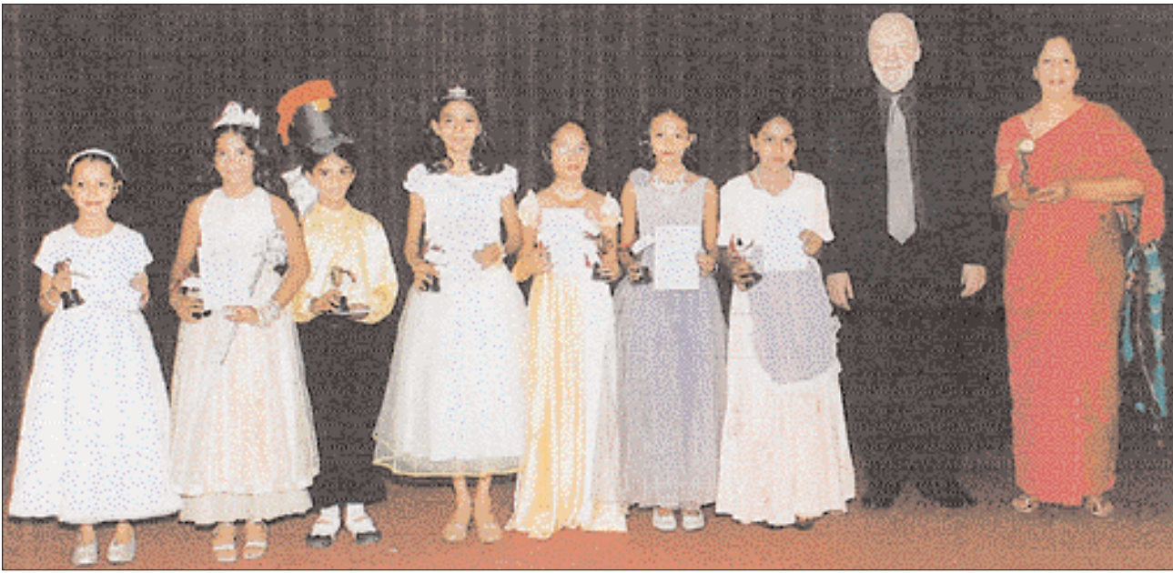
Devised Drama Group-17 to 18 years - All Island winners