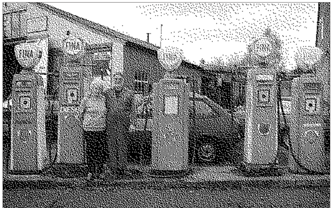
These rusty petrol pumps are believed to be the oldest working set in the country

"We have about 10 customers a week. Some are just passing by but others are regulars because they like using the pumps. For some people petrol stations are so