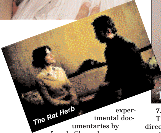
The Rat Herb