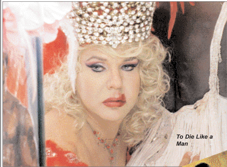
To Die Like a Man