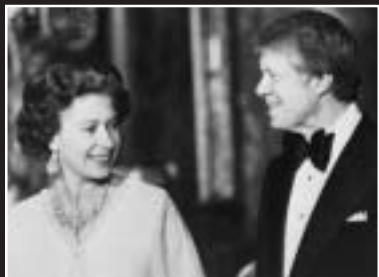
Queen Elizabeth with Jimmy Carter