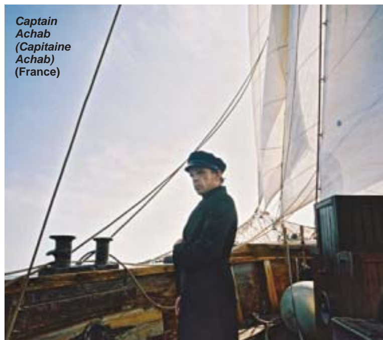
Captain Achab (Capitaine Achab) (France)

Two Sri Lankan writers from Vijitha Yapa Publications have made it to the longlist of the Impac Dublin award 2010, the richest literary prize in the world with a prize of 1 million Euros. The winner will be announced next year.