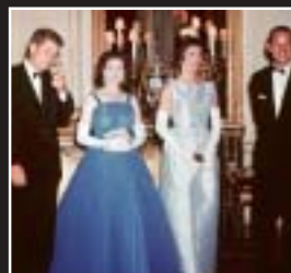
Queen Elizabeth with John F. Kennedy