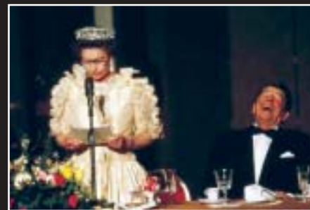
Queen Elizabeth with Ronald Reagan