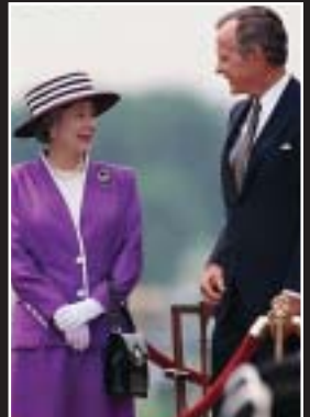
Queen Elizabeth with George Bush