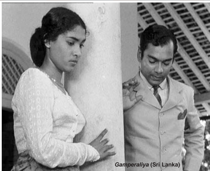
Gamperaliya (Sri Lanka)