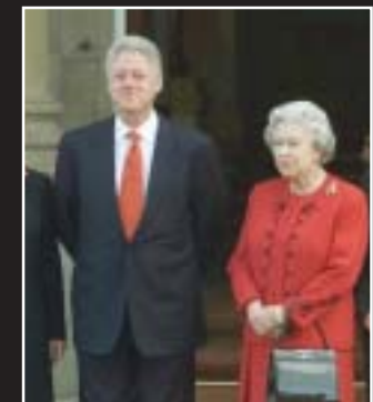
Queen Elizabeth with Bill Clinton