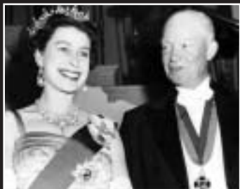
Queen Elizabeth with Dwight D. Eisenhower