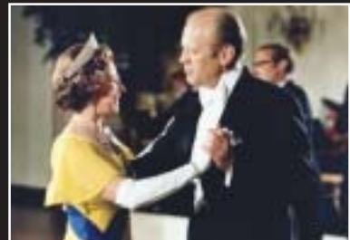
Queen Elizabeth with Gerald Ford