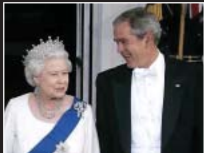
Queen Elizabeth with George W. Bush