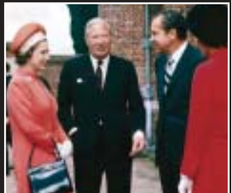
Queen Elizabeth with Richard Nixon