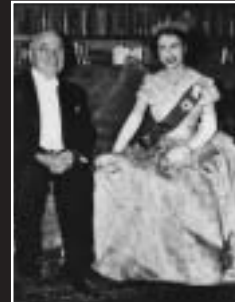
Queen Elizabeth with Harry S. Truman