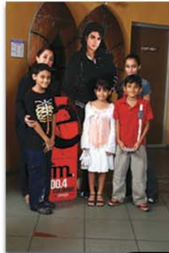
The girls from EFM