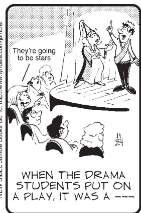
WHEN THE DRAMA STUDENTS PUT ON A PLAY, IT WAS A ---

Answer here: "O O O O O O" (Answers tomorrow)