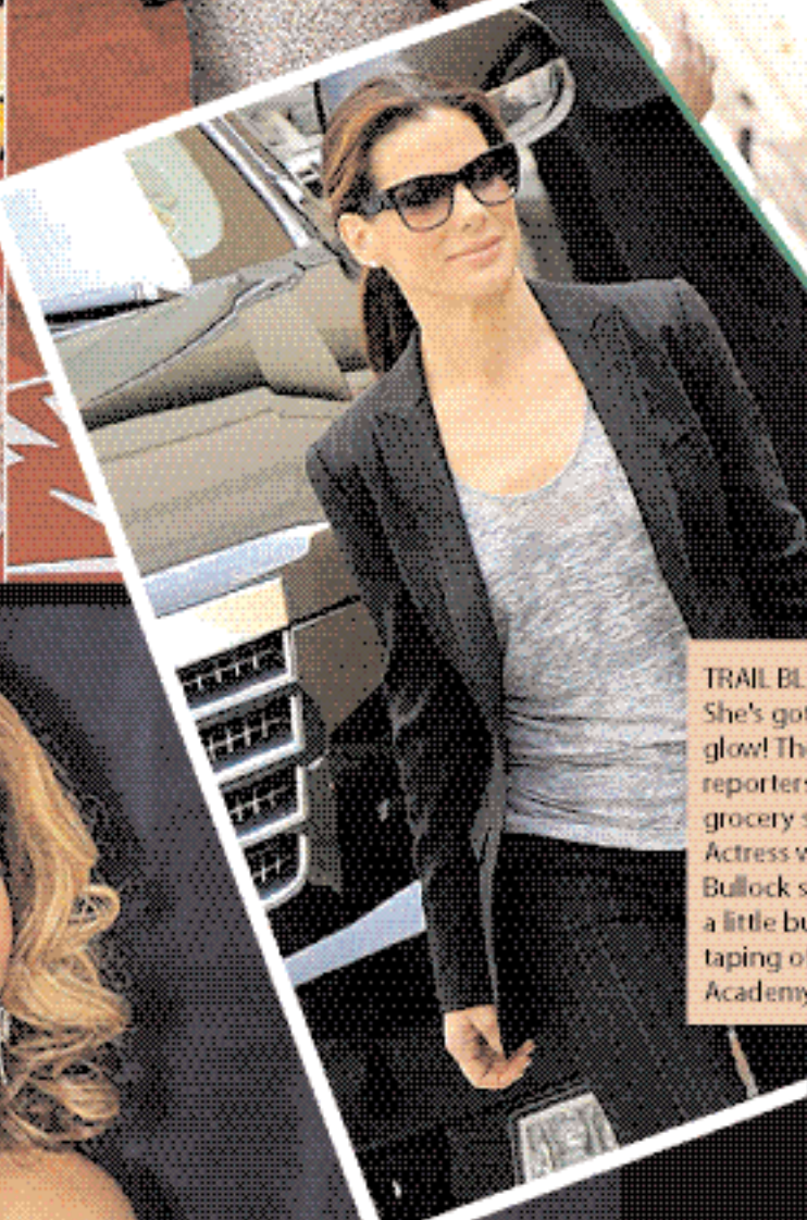
TRAIL BLAZER She's got that post-Oscars glow! Though she told reporters she planned to go grocery shopping, Best Actress winner Sandra Bullock still makes time for a little business, leaving a taping of Oprah Winfrey's Academy Awards special.