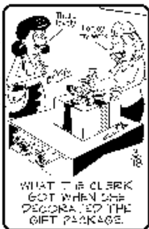
WHAT THE CLERK GOT WHEN SHE DECORATED THE GIFT PACKAGE.

Now arrange the circled letters to form the surprise answer, as suggested by the above cartoon.